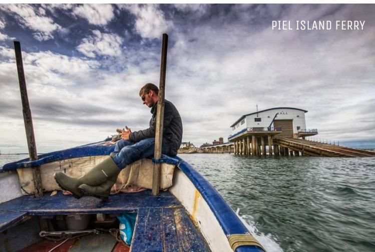
PIEL ISLAND FERRY

DISTANCE: 8.5 MILE DIFFICULTY: FLAT/EASY TRAFFIC: LIGHT MOSTLY TRAFFIC FREE